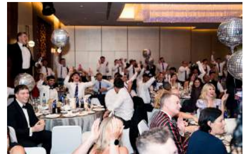
End of Season Awards - Eaton HK