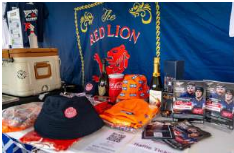
Red Lion - Shek Kip Mei Sports Ground