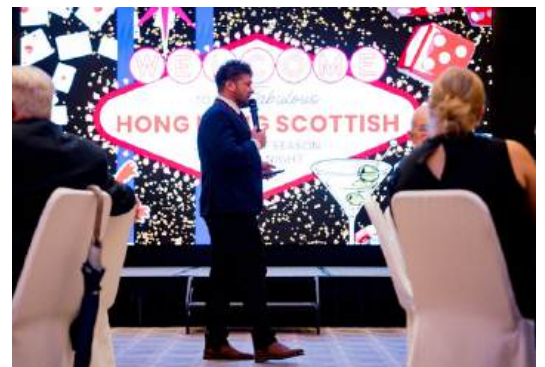
End of Season Awards Night - Eaton HK