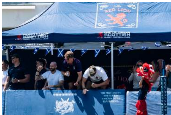
Grand Finals - King's Park