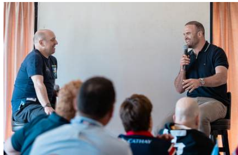
HKS 7s Breakfast - The Aviation Club