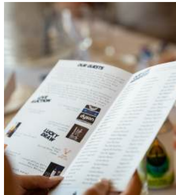
Long Lunch - The Yacht Club